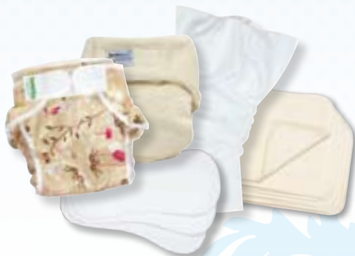
Bumkins Two-Piece Systems. Pictured above: Diaper Cover, Bamboo Fitted Diaper, Contoured Diaper, Flat Diapers and Inserts.

Bumkins Two-Piece Systems are the best choice for diapering breast fed babies. Breast fed stools are typically very runny and the use of a cloth diaper, either flat, fitted or contoured, with a Bumkins Diaper Cover provides the best leakage protection for this type of soiling. Two-piece systems are also the optimum choice for diapering newborns.